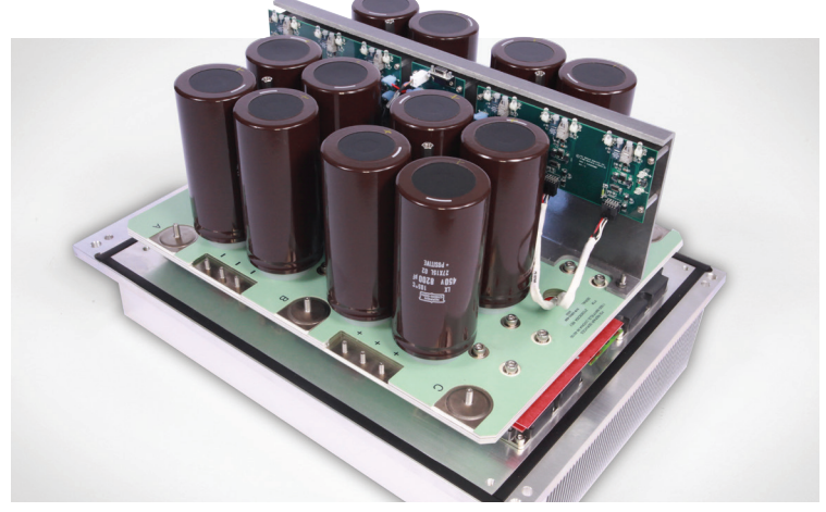
An upgraded replacement inverter from PSI Repair Services.

Need more peace-of-mind? Xantrex Matrix Inverters repaired and replaced by PSI have been rigorously field tested with successful results. Plus, PSI provides custom crating for all inverters to secure them from damage during shipping. Our inverter crates are also perfect for long term storage and return shipments of damaged cores. Give PSI a call today at 800-325-4774.