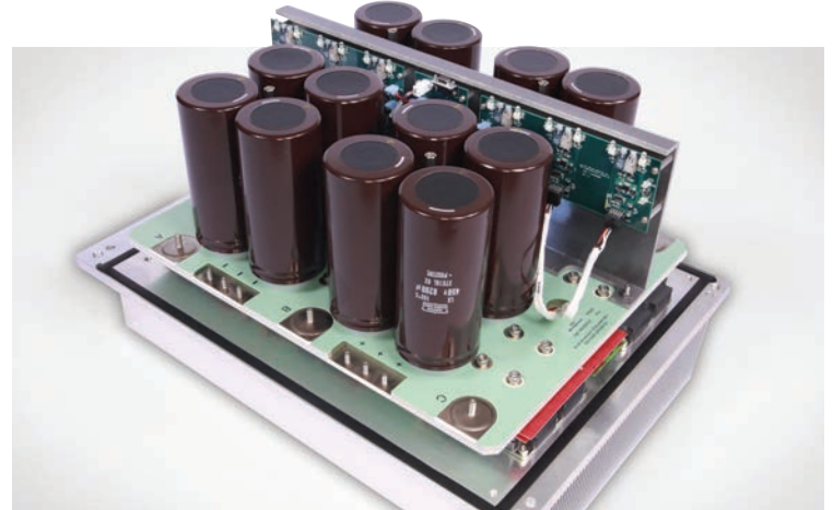
An upgraded replacement inverter from PSI Repair Services.

Need more peace-of-mind? Xantrex Matrix Inverters repaired and replaced by PSI have been rigorously field tested with successful results. Plus, PSI provides custom crating for all inverters to secure them from damage during shipping. Our inverter crates are also perfect for long term storage and return shipments of damaged cores. Give PSI a call today at 800-325-4774.